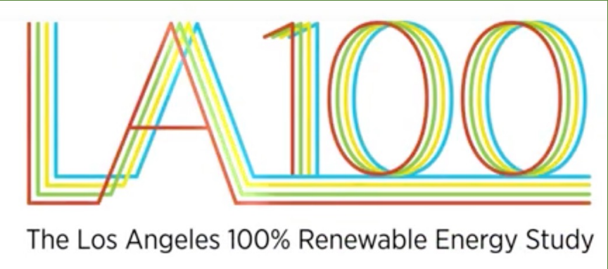
The Los Angeles 100% Renewable Energy Study